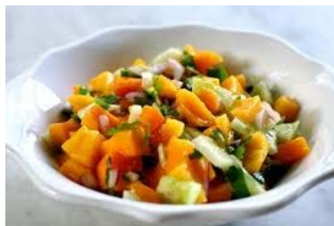
Classic Mango Salsa

Place mango in small bowl. Add remaining ingredients and toss.